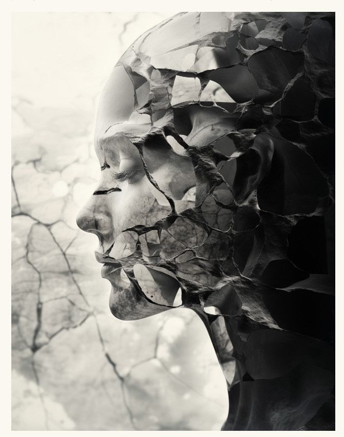
The relation between the mind, body, and the world have been a problem for most of the history of Western philosophy.

initially presented in the following passage: