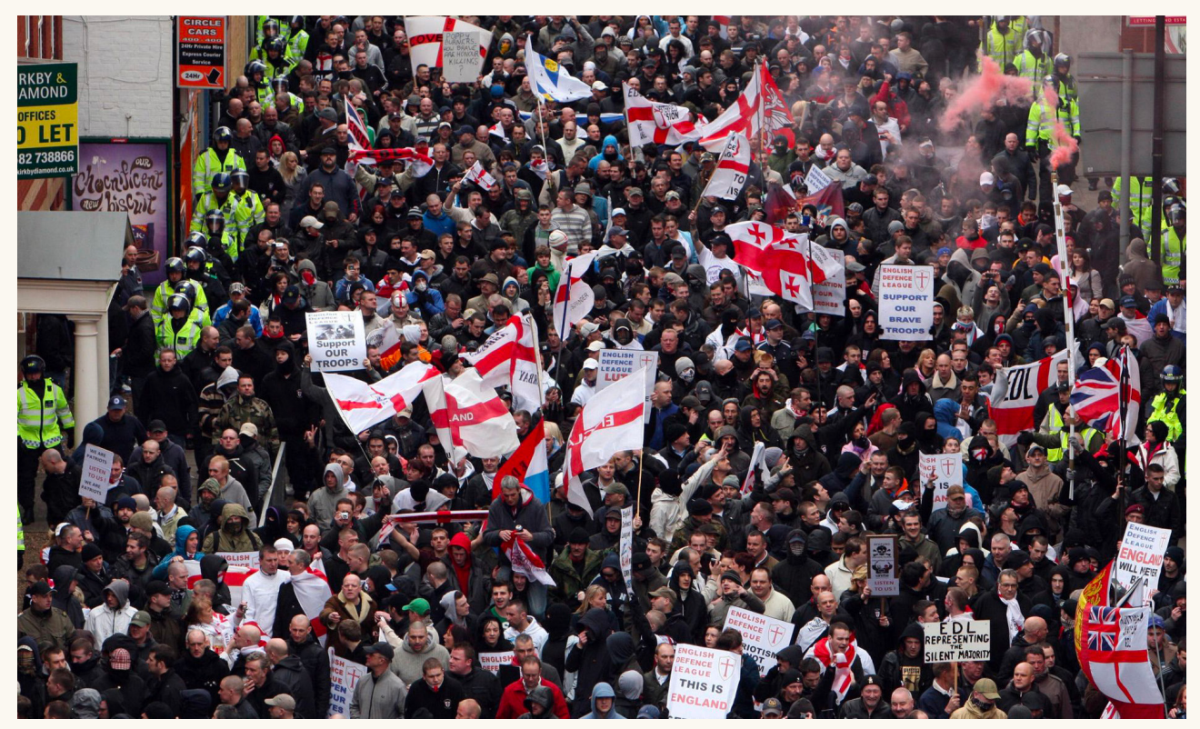
An EDL march in February 2011.

A Eurocentric history could lead to the establishment of more organisations like the English Defence League. The English Défense League is an Islamophobic, fair-right organisation that opposes the integration of Muslims into England and Europe as a whole. It continues to propagate anti-muslim beliefs, falsely justified by fraudulent historical representations of Islam and the west. They have commonly characterised Western society as progressive and tolerant while characterising Islamic society as intolerant and backward. This proves the harmful false dichotomy presented by a Eurocentric history that leads to the conclusion that non-European countries are inherently worse than European countries.