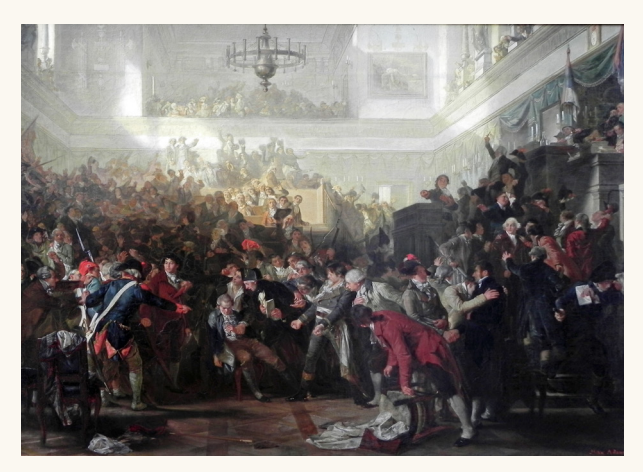
The Fall of Robespierre in the Convention on 27 July 1794, Max Adamo.

The will of the people can be seen as a negative reactive mechanism which is only triggered by extreme collective discontent shown in cases such as the French Revolution. The revolutionaries did not collectively agree on the principles of liberal freedom or the ideologies of republicanism. An expression of