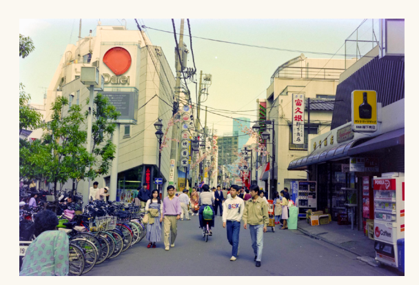
Tokyo during Japan's 'lost decade', a period of lengthy economic stagnation.

as well as writing of the Mexican and Scandinavian crises (Kindleberger & Aliber, 2005). He sees no economic growth stemming from such occurrences, but, crucially, does not blame economic growth as leading to financial crises – 'every mania is associated with a robust economic expansion, but only a few economic expansion caused by mania is only Reeting. Eichengreen analyses the Asian crisis, concluding that international capital Rows support make international trade possible, but also create financial instability (Eichengreen, 2019). Once again, the financial system and subsequent economic growth are not the culprit, but, rather, human action is the root cause of the financial crisis.