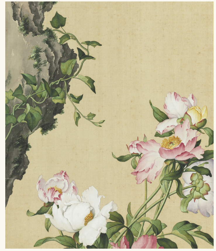
Picture of Paeonia lactiflora from Xian'e Changchun Album, Giuseppe Castiglione. This Italian painter worked as a member of the Qing Imperial Court, resulting in a distinctive mixed style. Cross-cultural research deserves much attention.

The paper will be structured through the following sections. We shall first delineate the Cartesian Self and alight its issues, then outline