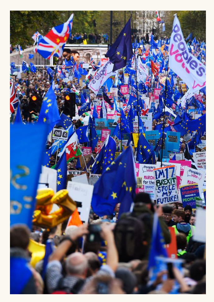
A protest congregated for a People's Vote on the 2019 Brexit Deal.

the will of the people was triggered due to an extremely wide-spread public discontent at the living quality under the French king. In regular elections, extreme circumstances have not been reached causing voters to choose from the available options the one which is the least in disagreement with the will of the people. The will of the people is not fully expressed due to the difficulty in determining the specifics of such will in one simple election. Furthermore, voters are limited by the available options to vote for. Taking the example of the general election, while the voter may disagree with the conservative, labour, and liberal democrat's policy, but due to there only being candidates representing these three parties in a particular constituency, that voter would have to vote for the candidate that they least dislike instead of the one they prefer. This problem