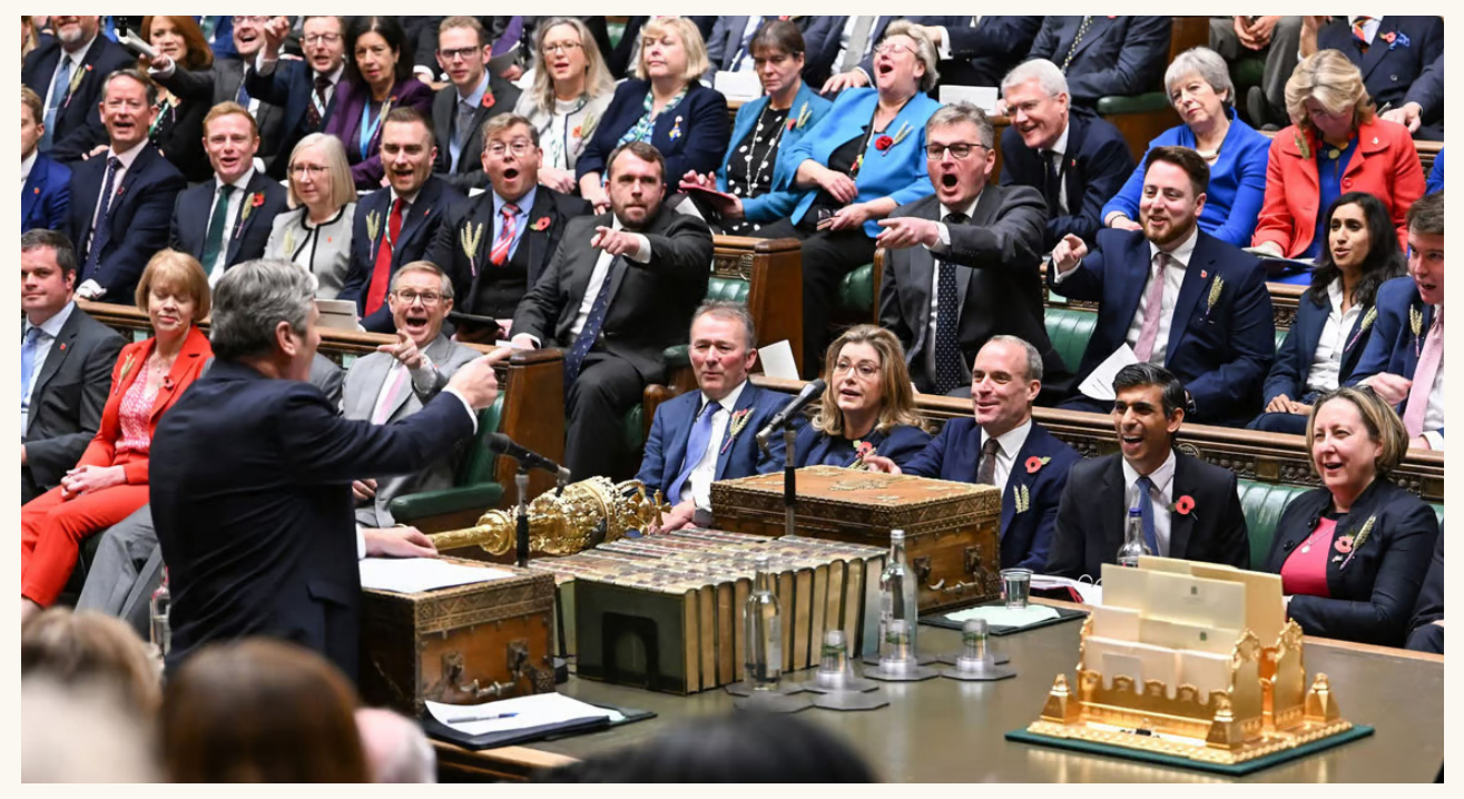
Prime Minister's Questions in the House of Commons, with Sir Keir Stammer showing humorously the direct conflict between Tories and Labour.

Another popular election type is approval voting, where candidates are either approved or rejected by each person, and the candidate with the most approvals wins. This means that voters can express preference for more than one candidate, thus having more freedom to share their will. However, voting for all candidates has the same effect as voting for none in this voting system, so voters are incentivised to disapprove candidates they would approve, to create less competition for their most preferred candidate (bullet voting - Obermaier, 2011), thus falling prey to strategic voting. Finally, we will refer to instant run-off voting in which rounds of voting take place, and in each one, least favoured parties are removed, until it is only a vote between the two that remain, or one party has over 50% of the vote. An issue with this is known as the centre-squeeze phenomenon, where the larger moderate parties cannot get 50% of votes on their own, causing votes of eliminated parties to be accumulated in smaller more extreme parties to reach the number of votes needed to end the election. (Marron, 2010 speaks on Burlington, Vermont 2009). This is damaging as these minor candidates' success (albeit awe-inspiring) are not accurate representations of the general public's preferred candidate and assumes a preference that was few people's first.