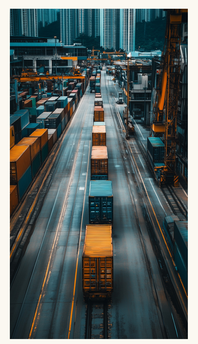
China is the largest provider of foreign goods to the US.