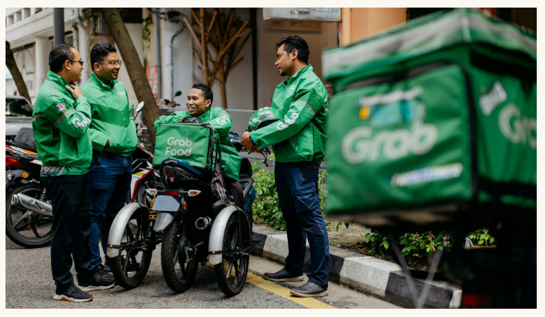
Gig economy workers for the food delivery company 'Grab'.

A gig economy is an economy that operates flexibly, involving the exchange of labour and resources through digital platforms that actively facilitate the matching of buyers and sellers. The labour market in the gig economy relies heavily on temporary or part time positions filled by independent contractors or freelancers rather than full-time permanent employees.