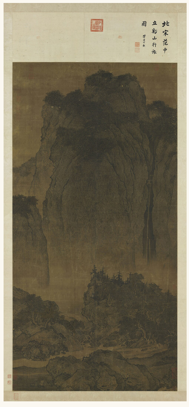
Travelers Among Mountains and Streams, Fan Kuan. The main point of Neo-Confucian dispute is the relationship between the heart-mind and objects of the external world.

lack of presentation of ren in unvirtuous men is not in fact a fault of ren itself, but in fact is the blockage and confusion caused by the unvirtuous themselves, which is regulated via the more active section; ren is always innately present and good. One must also note that ren is the origin of the unity of the self with the world, and not the process of it. Henceforth, ren is very much a static concept or idea (ibid.).