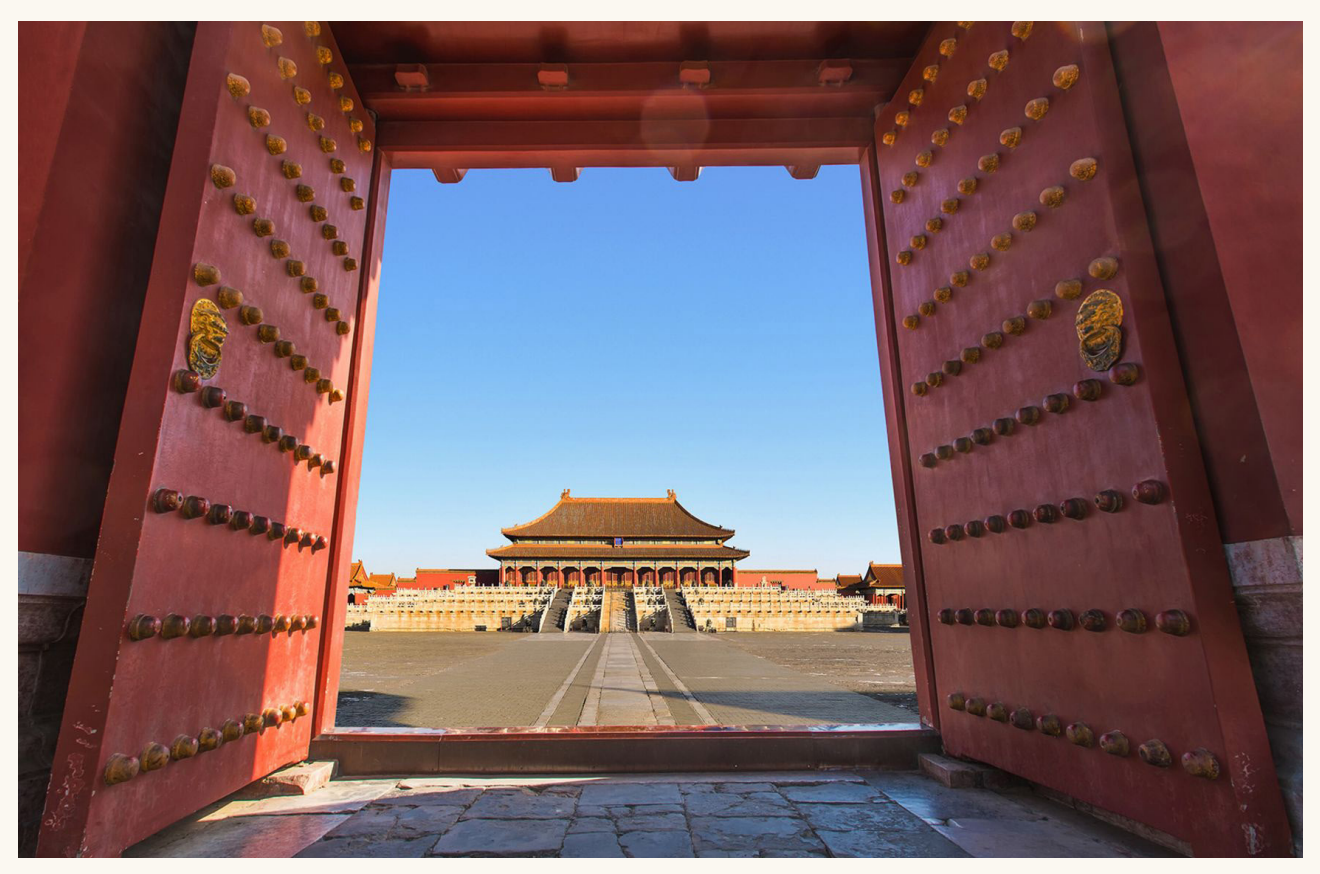
The Forbidden City have been the capital of the last two dynasties of Imperial China, serving as a testament to the fluctuating history of the country.

What this does is it changes warfare in the China's biggest battleground, the South China sea. This also means that the US is threatened in how it projects its sphere of influence because it must contend with a Chinese counterpart, or enemy.