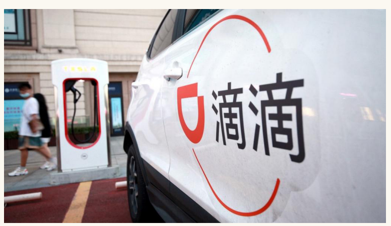
'Didi', a Chinese ride-hailing service provider that relies mostly on EVs.

Besides, a statistic indicates that the demand for global online gig workers has increased by 41% to 435 million between 2016 and the first quarter of 2023 (Hussein, 2023). While location-based gigs such as Uber, Lyft, and TaskRabbit require labour for transportation and delivery, online gig assignments, such as website design and software development, could be completed at home. Coupled with the gig economy, which is promoting the shift towards self-employment and greater remote job opportunities, this will help drive down global carbon emissions by promoting workers to work from home