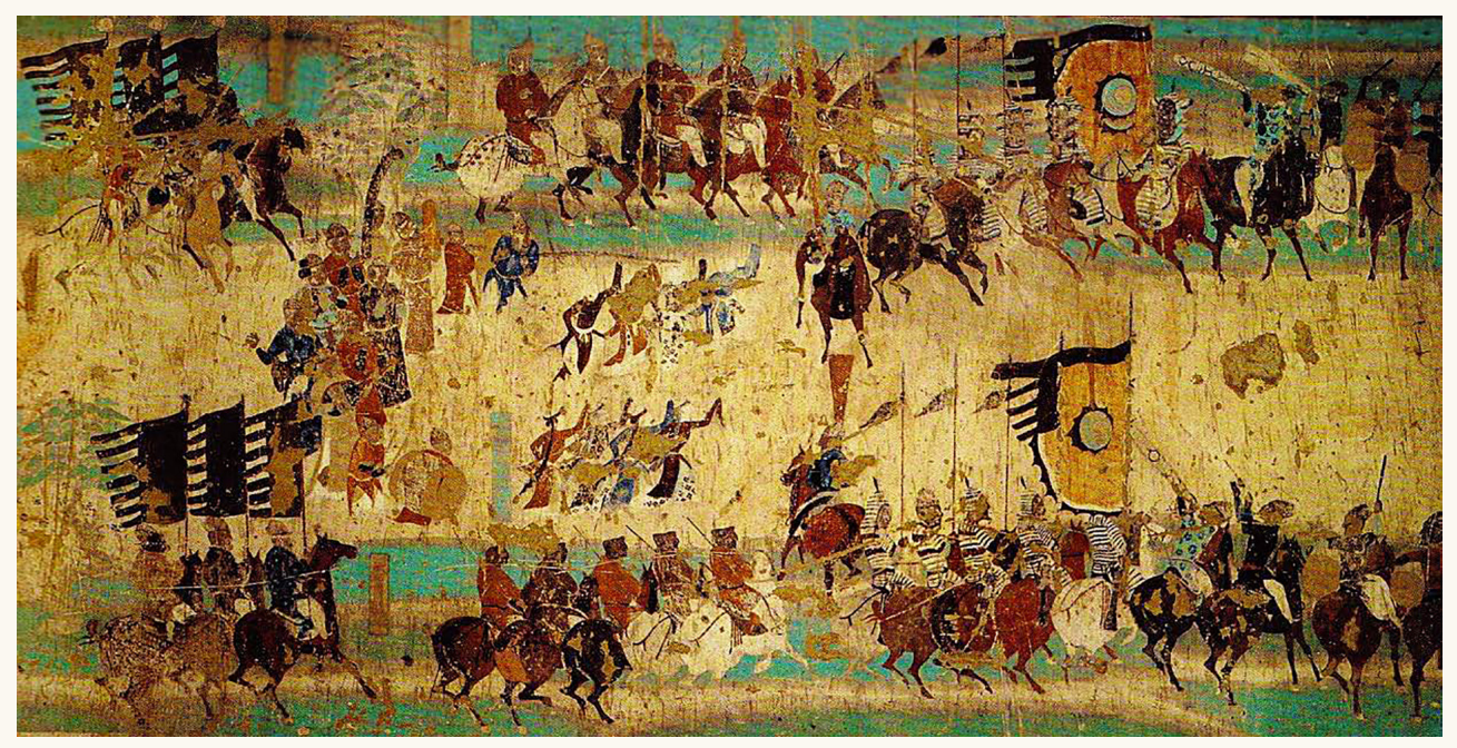
Section of a wall mural commemorating the victory of Zhang Yichao- the founder of the Guiyi Circuit over the Tibetan Empire, Mogao Cave 156, Late Tang Dynasty (9th century).

A potential solution is to make sure that a more holistic view of history is taught to everyone, for example, the GCSE course is mainly focused on Nazi Germany. This is important to learn but in addition to Nazi Germany covering history from different continents like for example exploring the Cuban revolution and also studying leaders like Genghis khan. In turn, if people learn about people who are historical figures like Fidel Castro and Che Guevara it will give students more perspective of how leaders solve different problems. From Genghis Khan and the Mughal empire, we can learn how powerful empires take control. Not only will it present lessons for us to learn, but it will also help the students to understand the culture of non-European and they can gain fundamental information about these areas. Potentially the GCSE syllabus could contain history from each continent for young historians to have a well-rounded perspective of history.