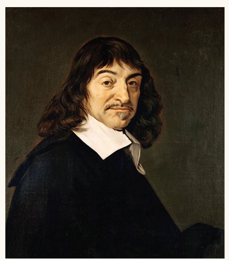
Portrait of René Descartes, Frans Hals.

There are manifold properties of this equivalence between self and the mind, though mainly regarding the structure of the mind which presents significance in expositions both in the specific context of Descartes and in relation to Neo-Confucian philosophy.