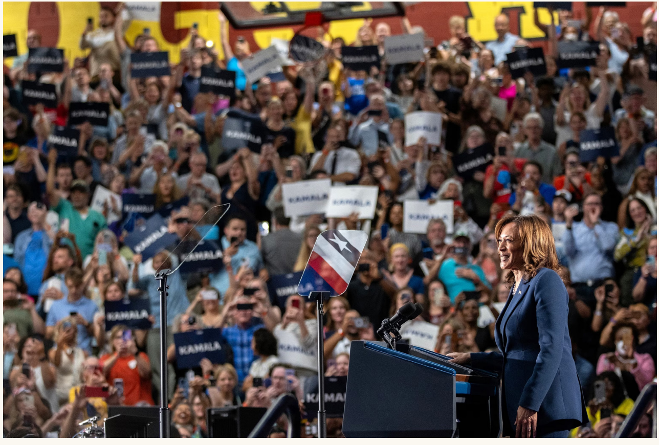
Presidential candidate for democrats Vice-President Kamala Harris speaking at a rally in Wisconsin, an example of how an election is the only time there is more or less direct contact between policy makers and the public.