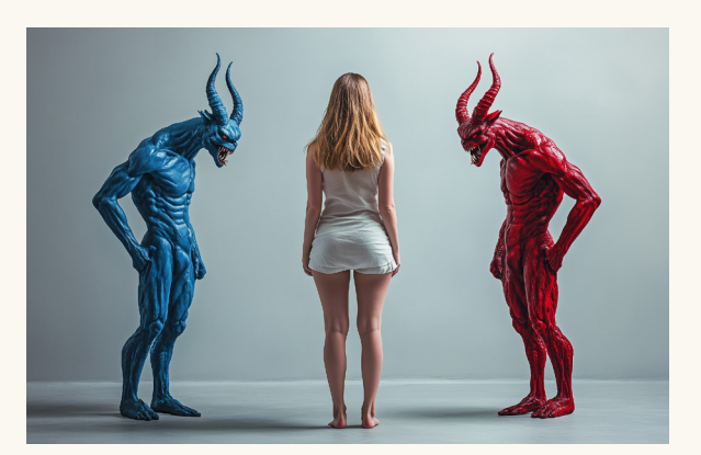
Elections now are more about choosing the least bad candidate instead of a preferential one.

Likewise, with heuristics (a process of intuitive judgement, operating under conditions of uncertainty, that rapidly produces a generally adequate, though not ideal or optimal, decision, McDonough) many voters are led astray by elaborate media stunts and the most recent captivating news headlines, to the point that their true intentions are disparaged. Within this lens, we are greeted with the harsh reality - deciding who to vote is a serious decision that is overlooked by many for convenience. Our clouded minds are relieved by the simplicity of the ballot, that we neglect it by voting on a whim, objectively undervaluing its importance in society.