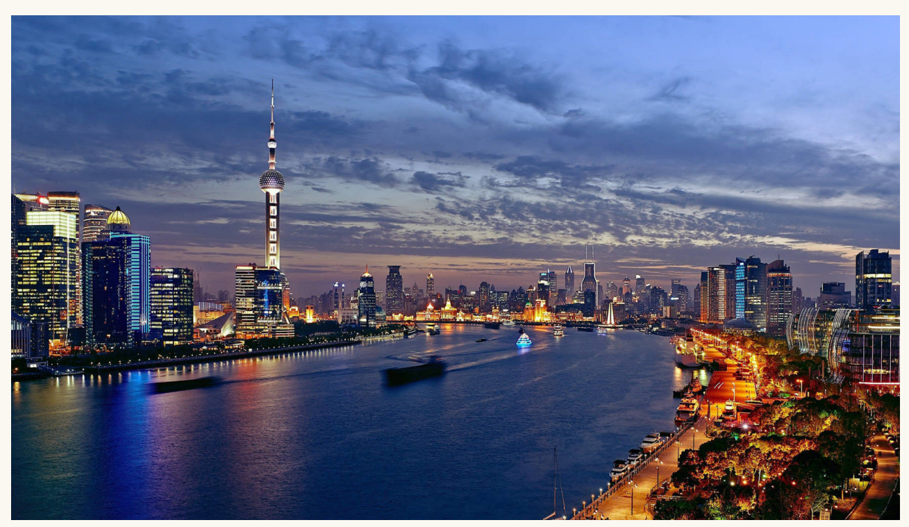
Shanghai, after China's opening to companies and investment, have achieved astonishing growth in the past decades.

left the world in awe as the country was transformed from an underdeveloped backwater of Asia to become the world's second largest economy in 2010. At one point the Chinese military budget was a negligible $15 billion. In 25 years, the Chinese military budget has increased five-fold and has resulted in a military which not only leads the world in hypersonic rocketry but is close to undisputed control of neighbouring seas (once not thought of being possible for a competitor to the United States). This is more than a far cry from China just two centuries before. "Fear of war creates grounds for hope," said Henry Kissinger, the father of US-China relations post Mao in an interview with the Economist in May 2023. Fear of war or rather fear of those who had mongered war in China in the past has driven China's determination, arguably still today. To think China wants to rule the world is a strange notion. China only wishes to extend her sphere of influence enough so that China does not become victim to her prior pitfalls. However, this has brought with it the state we know today.