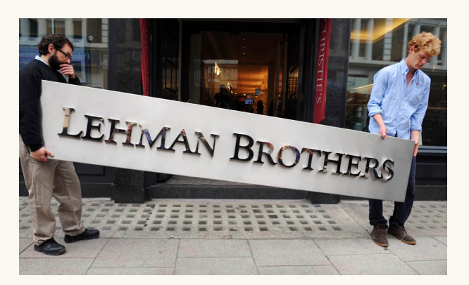
'Lehman Brothers', an investment bank whose bankruptcy is often cited as a contributing factor to the 2008 financial crisis.

Now that both terms have been clarified, the relationship between them can be analysed. Upon first glance, it would seem that crises are inevitable results of economic growth; as a country develops, its capital inflows increase, bolstering investor confidence, leading to exaggerated growth, resulting in a crash. Additionally, the unpredictable nature of external shocks, leading to contagion, suggests that financial crises cannot be prevented. However, I argue that this is not true – financial crises arise from irrationality. In the case of bubbles, times of inflated asset value (which are followed by large crashes, as in the case of the dotcom bubble bursting in 2000, or the housing bubble, the latter of which crashing causing the global financial crisis of 2007-9, as a result of subprime mortgages and complicated financial instruments), the crisis arises from investor frenzy to make profits, whilst ignoring the potential, inflated risks caused by the bubble. The existence of bubbles, and subsequent crises, is not a result of economic growth or the financial system – it is due to investor negligence and irrationality. The free flow of capital provided by the financial system does not cause the bubble; it merely provides some conditions necessary – the real issue comes from market frenzy. Janeway argues that bubbles are actually