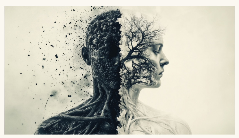
The Cartesian theory of the mind if resolved and its inconsistency issues could serve as a building block for other conceptions of self.

Indeed, one may argue that there does not exist a necessity to complicate the theory of cognition as offered by Descartes, and that there is no basis that clear and distinct ideas are derivative of the natural light. One must, however, acknowledge that there exist deep ambiguities concerning the Cartesian cognitive system, which we may summarize in the following argument. We know that there exist ideas that is provided by the intellect, from which ideas are then arranged in relation and is judged by the will, and by which such are propositions that are judged to be incorrect due to confusion and ambiguities of the ideas which itself is a manifestation of attempting knowledge outside of the bounds of the intellect. The will is supplied by a propensity of truth by the natural light, but since it is the ideas in relation to other ideas that are judged, there must then be a reference of truthfulness that